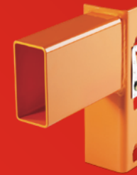
RHS beam. Excellent load carrying capacity and resistance to damage.