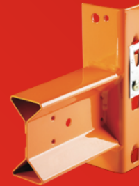
I-Beam. Don't pay for steel you don't need.