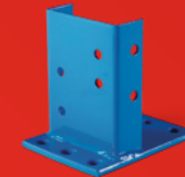
Heavy duty baseplate.