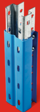
Splice to connect uprights.