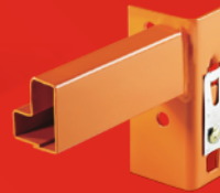
Stepped beam. Designed for longspan shelf storage.