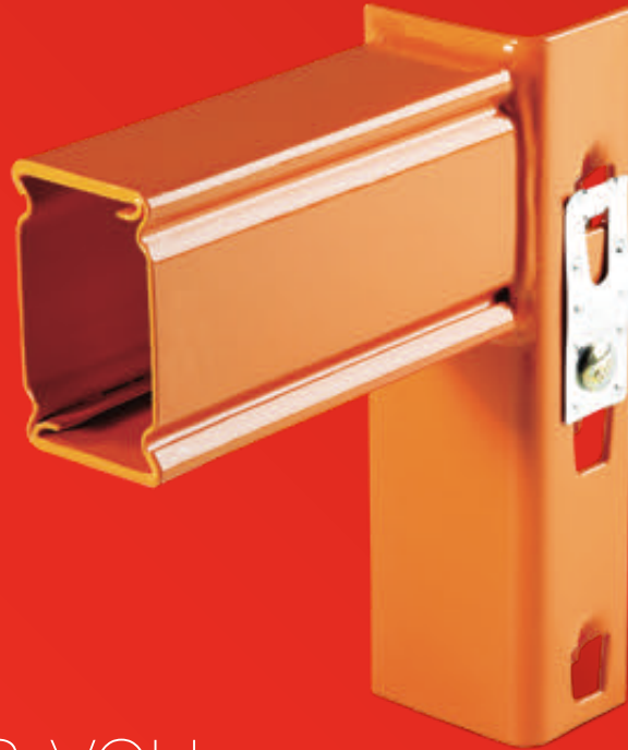
Box beam. The market leader.

Dexion provides you with more component choices.