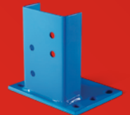
Narrow aisle baseplate.