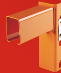
Open beam. For lighter loads.