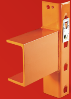
Channel beam. Excellent load carrying capacity and resistance to damage.